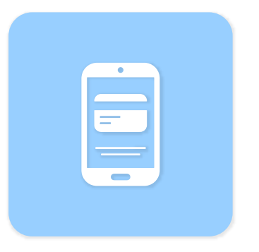
Pay with EFT